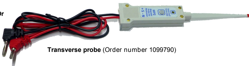
Transverse probe (Order number 1099790)